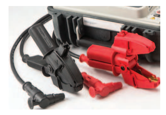
A new tough adjustable clamp has been designed to ensure flexibility in many applications and provides a good connection with the test piece