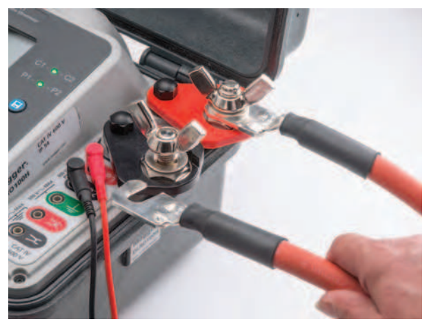
A new terminal adapter has been designed to enable the use of users own test leads.