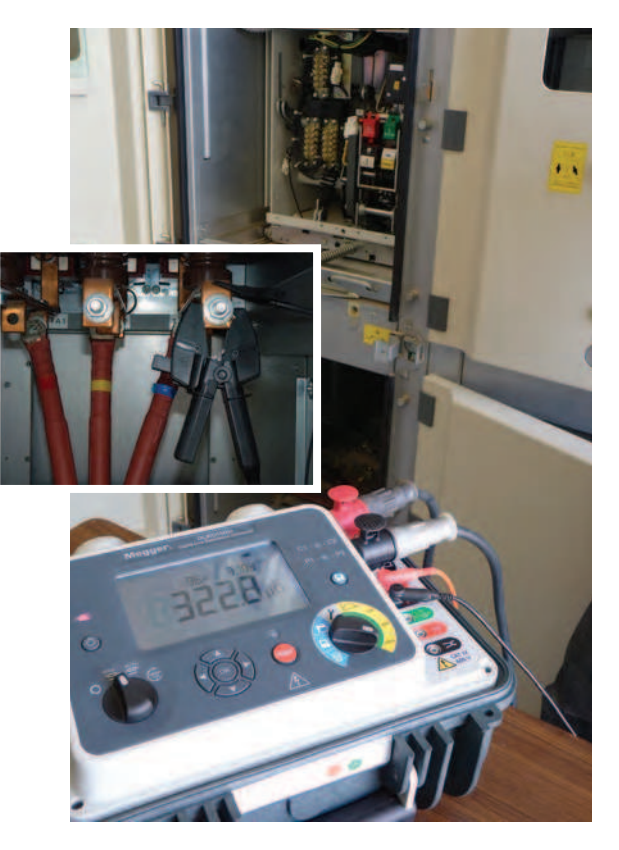
DLRO100H testing rack-mounted, 3-phase circuit breakers