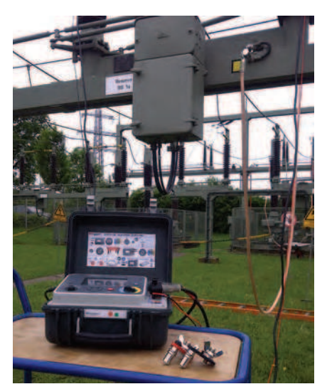
DLRO100 testing circuit breaker