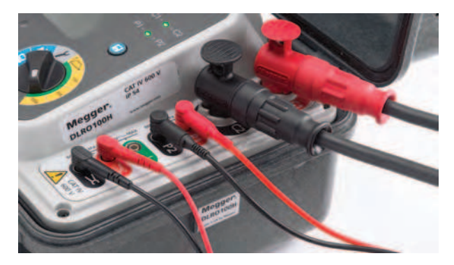
Robust, high-current CATIV leads for Kelvin configurations; current clamps for measurement on circuit breakers